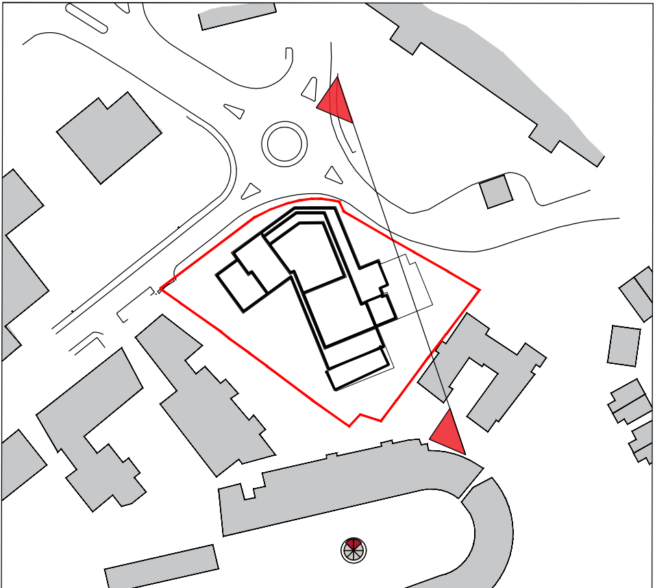
Key Plan 1:1000

NOTE ALL DIMENSIONS TO BE CHECKED ON SITE NO DIMENSIONS TO BE SCALED FROM THIS DRAWING THIS DRAWING IS TO BE READ IN CONJUNCTION WITH RELEVANT CONSULTANTS DRAWINGS