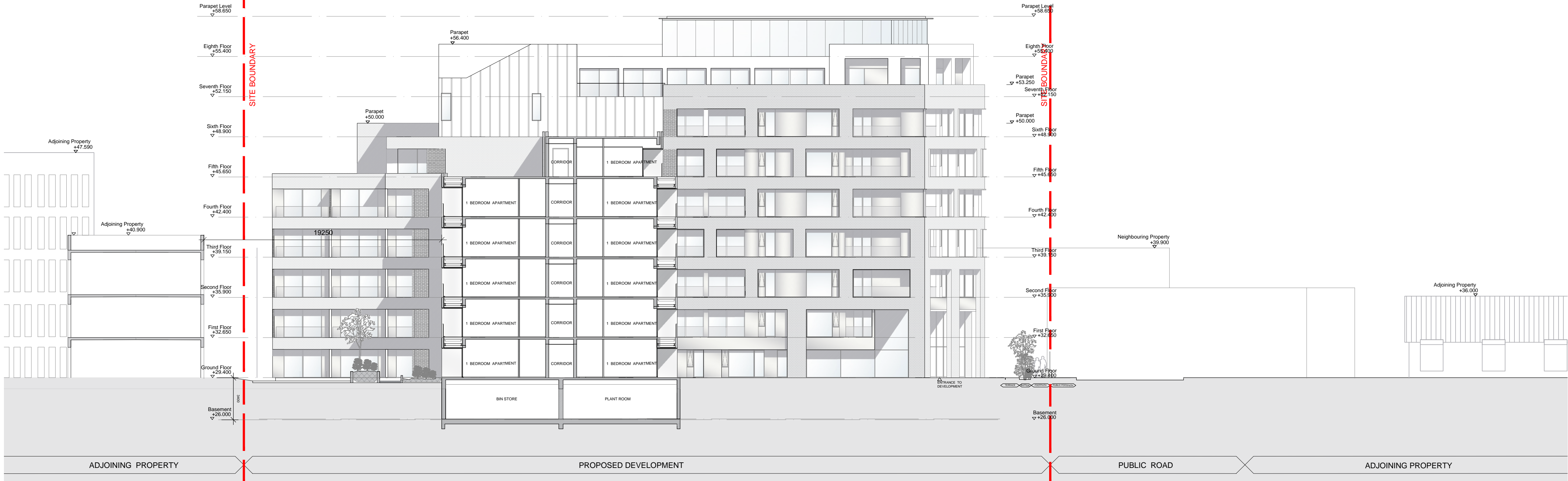
Section C-C - Scale 1:200@A1

NOTE ALL DIMENSIONS TO BE CHECKED ON SITE NO DIMENSIONS TO BE SCALED FROM THIS DRAWING THIS DRAWING IS TO BE READ IN CONJUNCTION WITH RELEVANT CONSULTANTS DRAWINGS